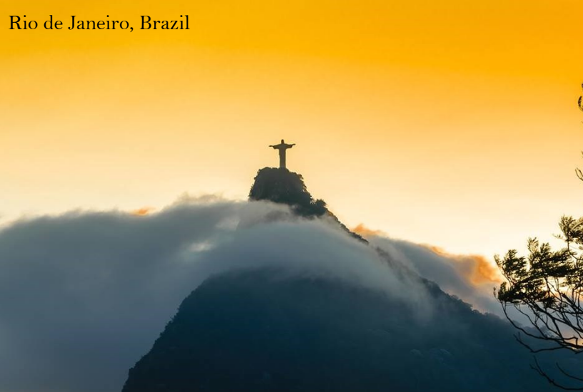
Rio de Janeiro, Brazil