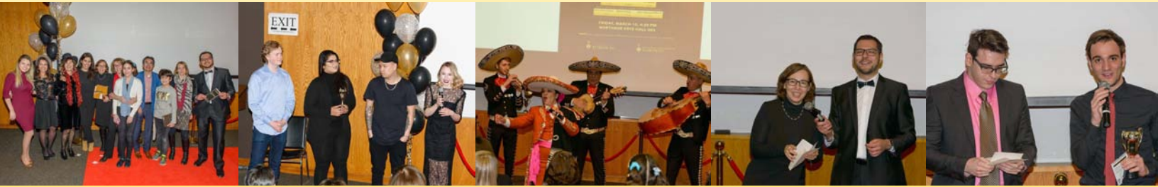
Portuguese Program Luncheon: March 30