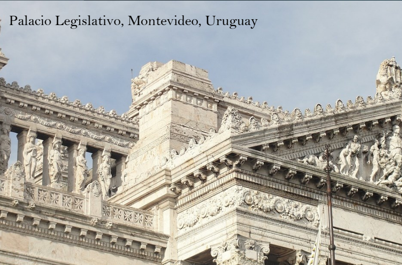
Palacio Legislativo, Montevideo, Uruguay