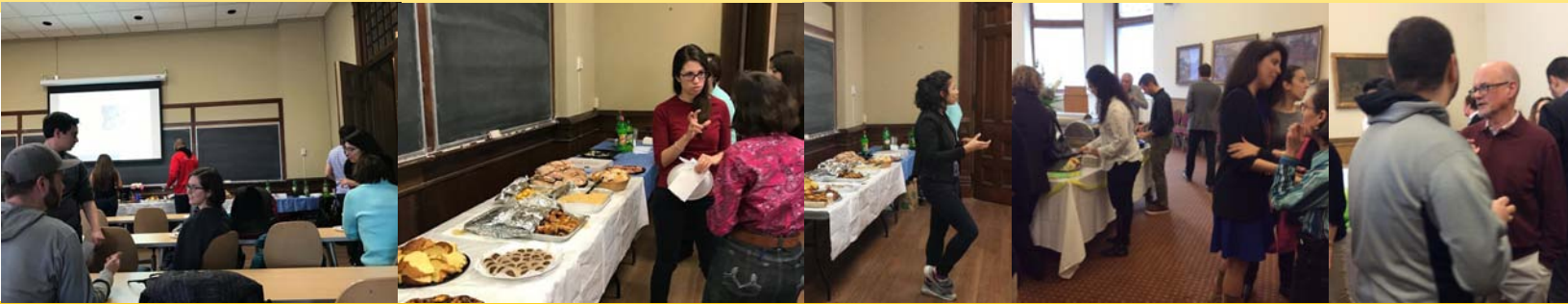
Spanish & Portuguese Undergraduate Awards Ceremony: March 30