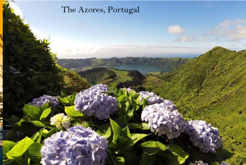
The Azores, Portugal